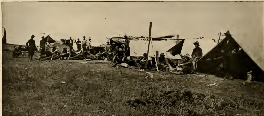
TWENTIETH KANSAS CAMP SCENE NORTH OF CALOOCAN.